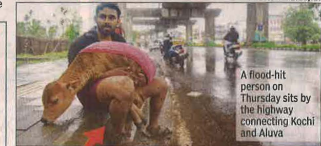
A flood-hit person on Thursday sits by the highway connecting Kochi and Aluva